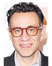
Fred Armisen visits Conan.

LATE LATE SHOW (12:35 a.m., CBS/2) — Ozzy Osbourne