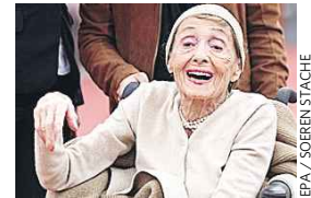
Luise Rainer's film career is honored today on TCM.

LONG-LIVED OSCAR WINNER Luise Rainer was born in 1910, won back-to-back Academy Awards in 1936 and 1937, and died Dec. 30, 2014, at age 104.