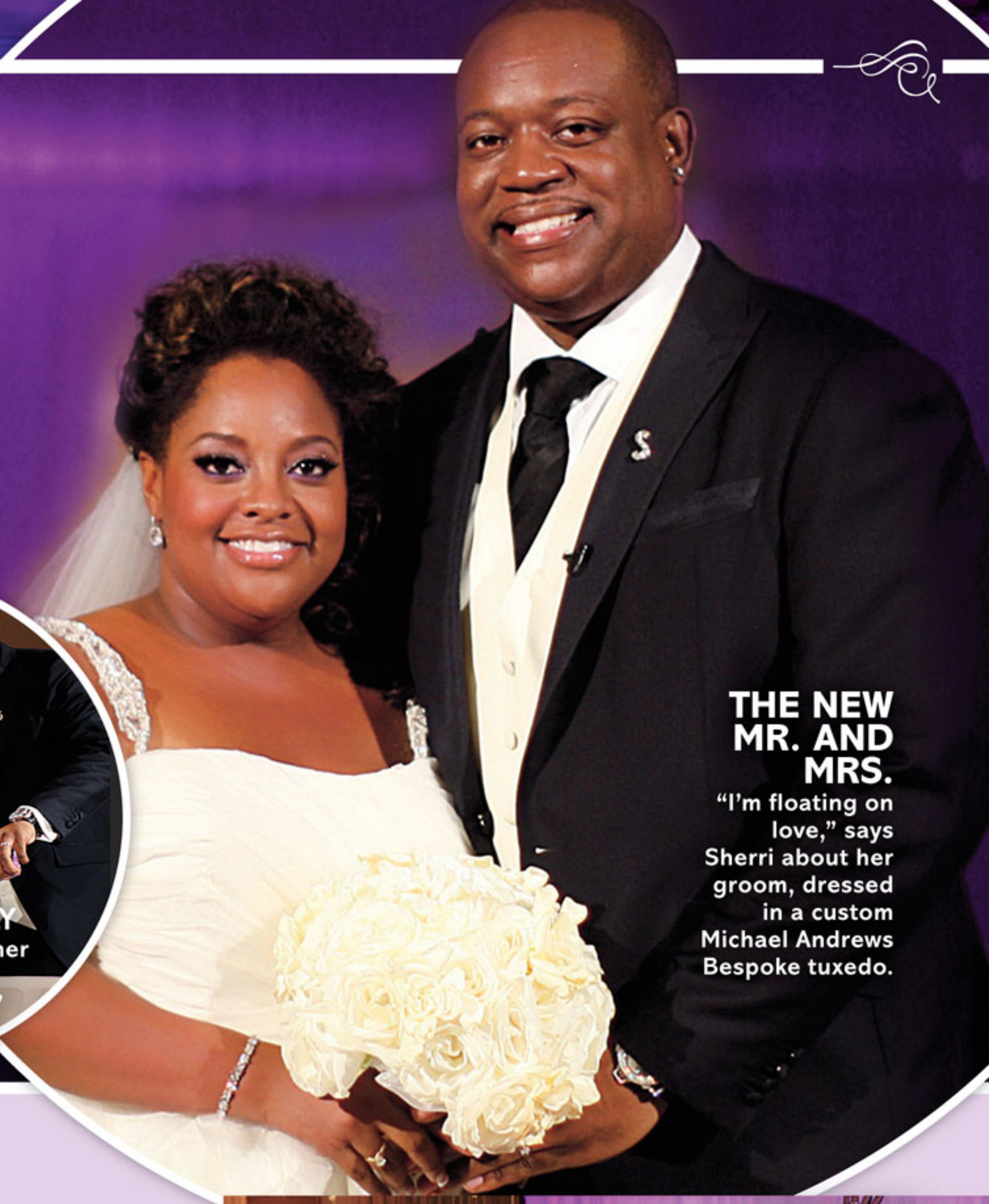
THE NEW MR. AND MRS. "I'm floating on love," says Sherri about her groom, dressed in a custom Michael Andrews Bespoke tuxedo.