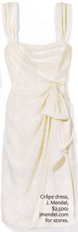
Crêpe dress, J. Mendel, $2,500; jmenzel.com for stores.

Civil ceremonies are hotter than ever—à la Ellen Pompeo and Chris Ivery and Jessica Alba and Cash Warren. As for what to wear? You won't feel out of place in an off-white cocktail dress.