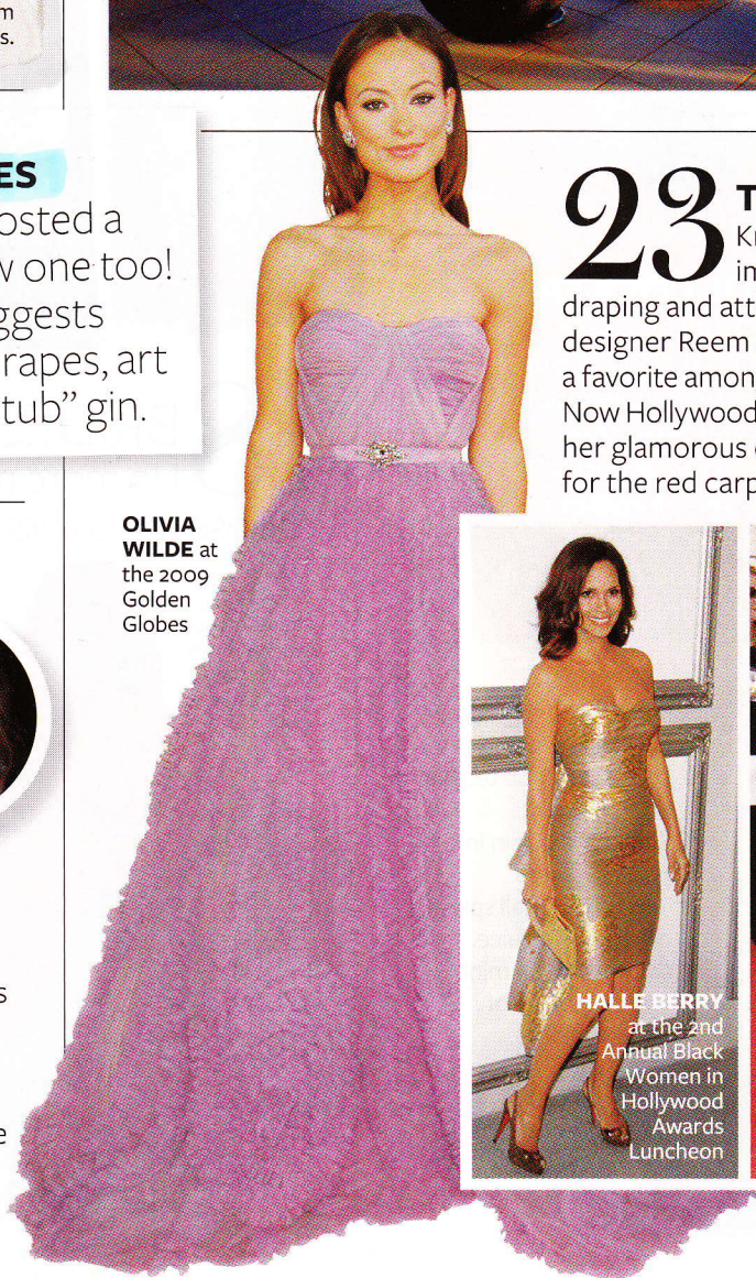
OLIVIA WILDE at the 2009 Golden Globes