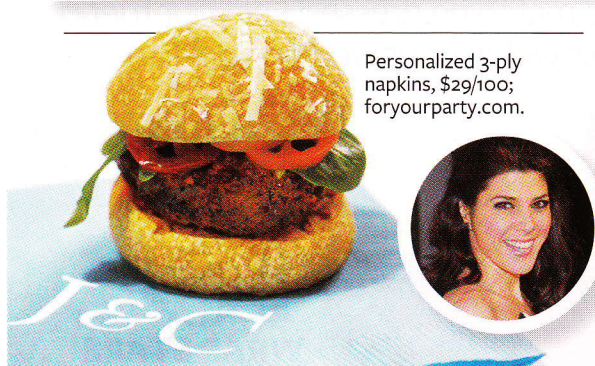
Personalized 3-ply napkins, $29/100; foryourparty.com .