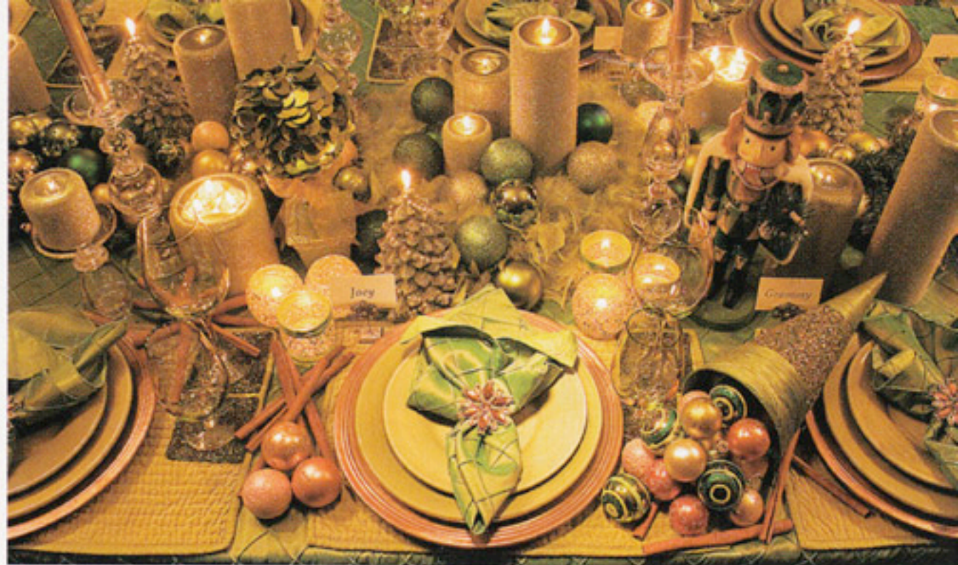
"Go for a matchy look with an even flow of colors and to the theme!" says Russo of this table topped with 40 candles from Pottery Barn (where they are available for $6 to $42).