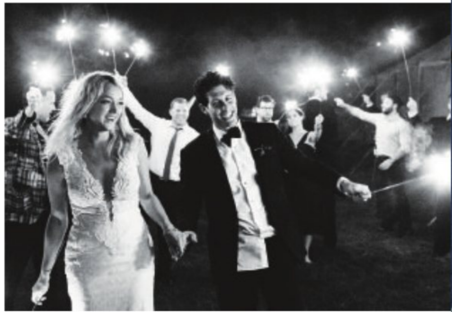
Clockwise from above: A monochromatic color scheme sets the tone. A wishing tree is a fun and whimsical way for guests to express their thoughtful well-wishes to the newlyweds. Make a grand exit with doves, special music or sparklers upon leaving the reception.