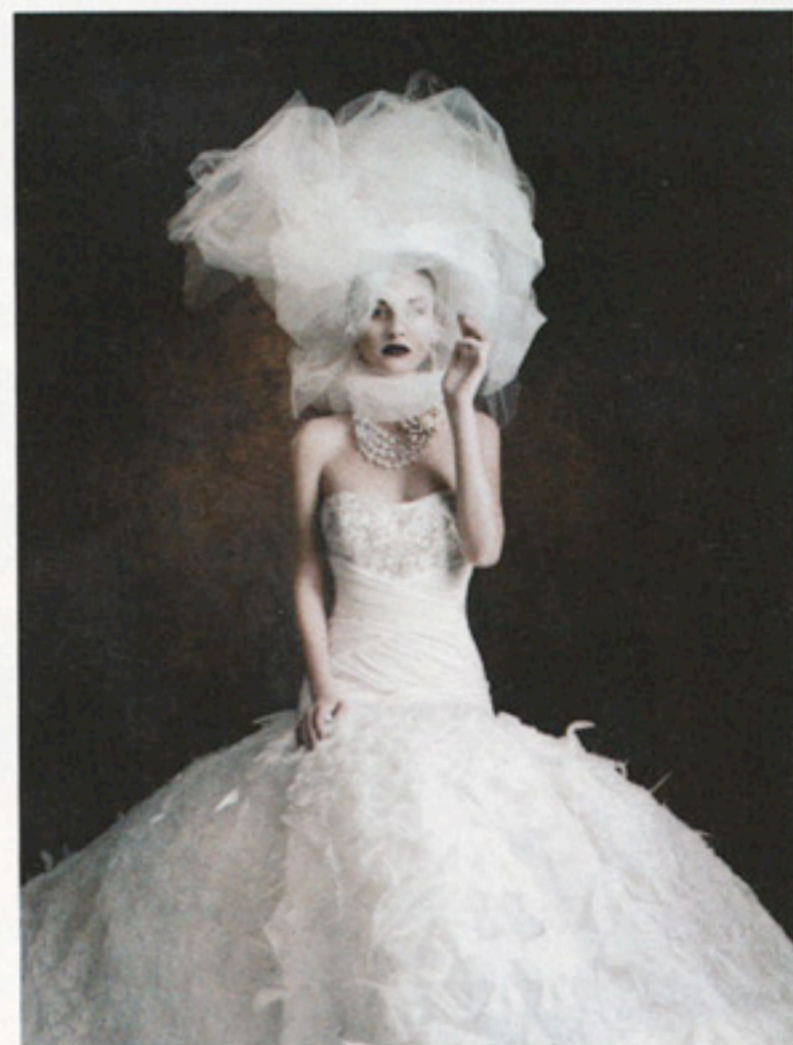
Strapless drop-torso gown with embroidery and draped Silk Taffeta midriff, Organza ribbon and feather skirt. Available in ivory and white.