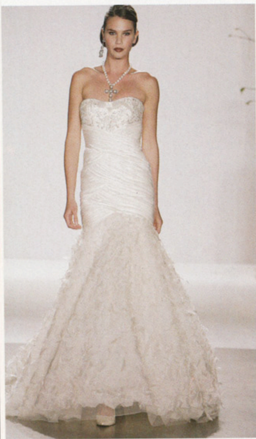
Strapless Silk Satin drop-torso embroidered narrow gown with shredded Silk Tulle skirt. Available in ivory and white.